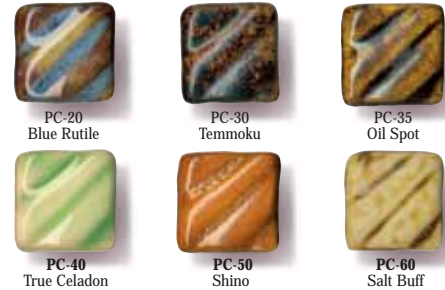
PC-20 Blue Rutile PC-30 Temmoku PC-35 Oil Spot PC-40 True Celadon PC-50 Shino PC-60 Salt Buff

Six pint jars of our new Potter's Choice High Fire Glazes A $43 Retail Value