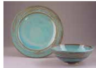
Plate and bowl were decorated with PC-20 Blue Rutile by Tracy Gamble, Plainfield, Indiana.