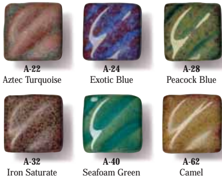
A-22 Aztec Turquoise A-24 Exotic Blue A-28 Peacock Blue A-32 Iron Saturate A-40 Seafoam Green A-62 Camel

Six pint jars of our new Artist Choice Glazes A $41.70 Retail Value